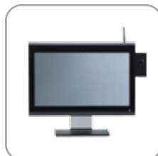
Vesa Mount or Stand