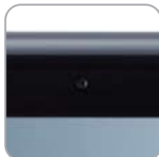
1.3 Megapixel Camera