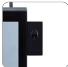
Finger Reader or MSR