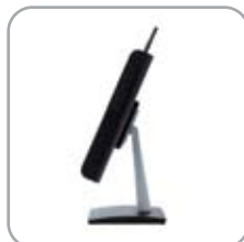
0° ~ 90° Tilt