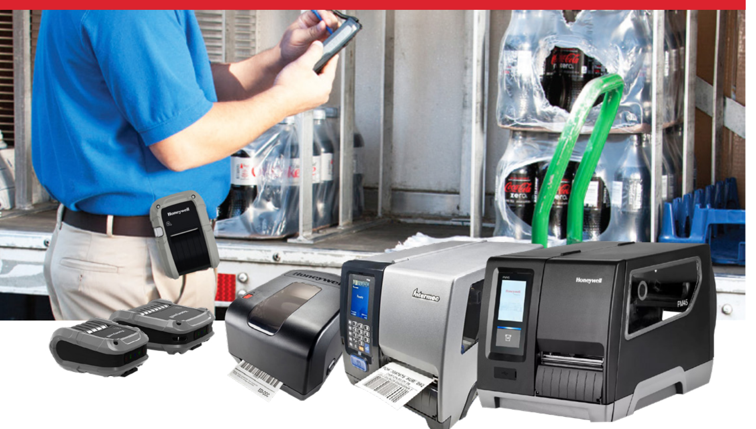
High Performance, Compact and Economical industrial Printing Solutions