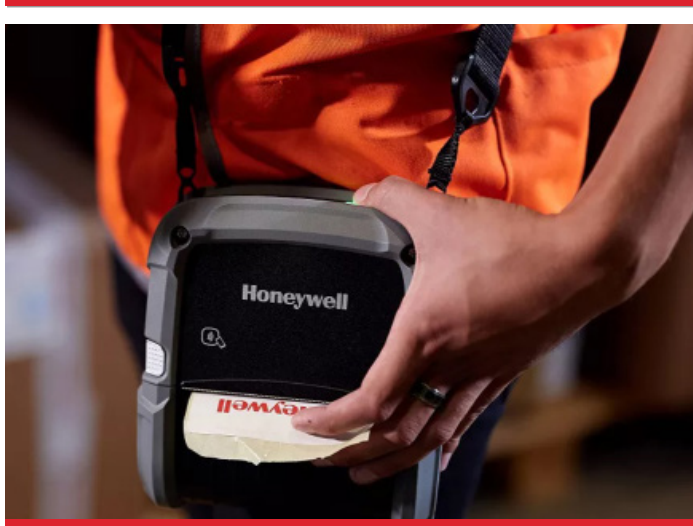
RUGGED MOBILE PRINTERS