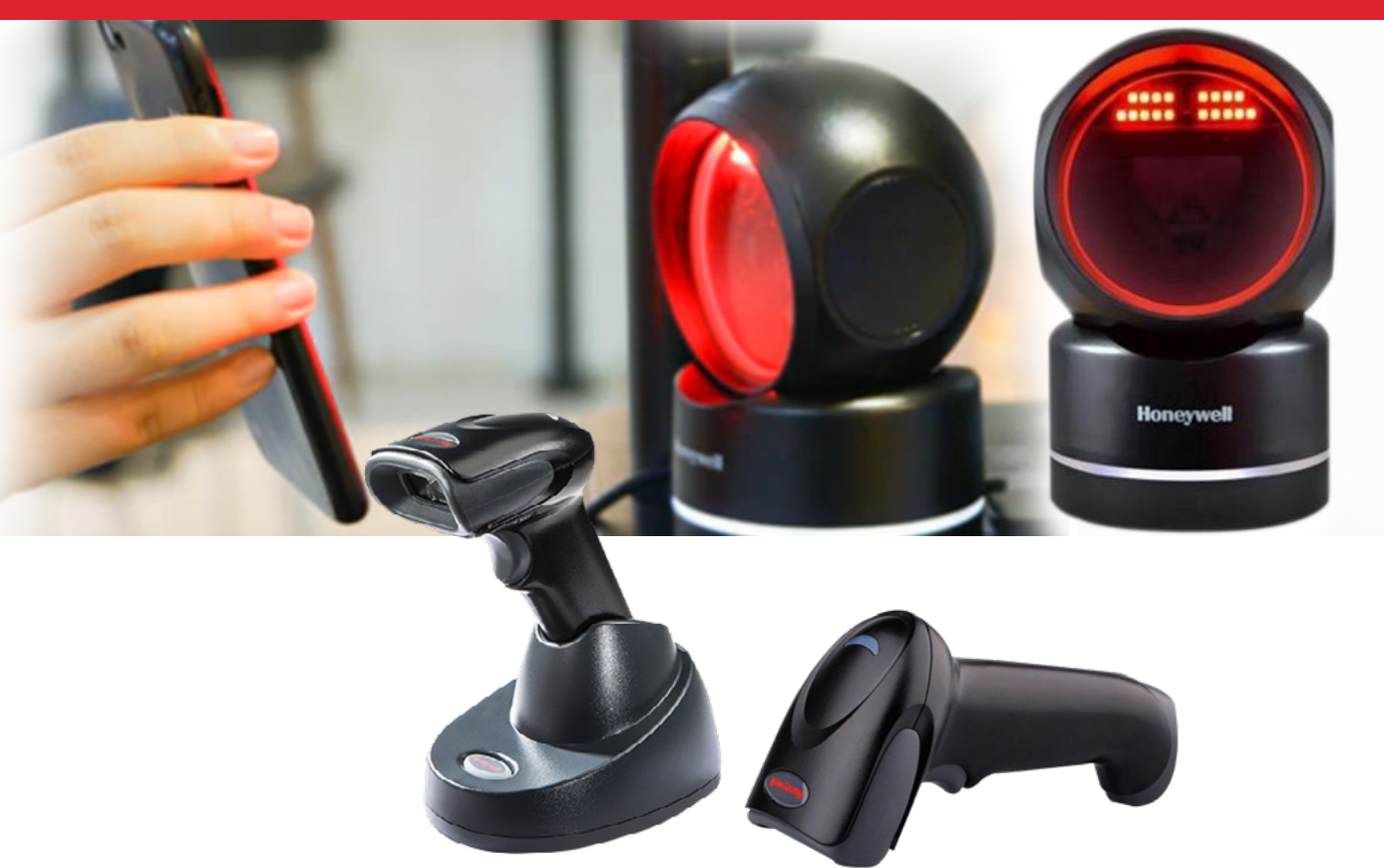
Boosting the Decoding Range and Improving Efficiency