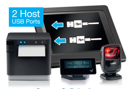
Star mC-Print3. TSP143III, TSP654II Series including Apple AirPrint™ & Sanei Range

Ideal for applications where a lower cost tablet is used for its compact size/slim profile, ease of use and connected services on sites where staff are present to replenish print media. Star's mC-Print3 & HI X Printer Series simplify the kiosk design providing a hub with 2 host USB ports for Symbol/Zebra DS9208 2D scanner and Star SCD222 customer display where needed as well as remote communication.