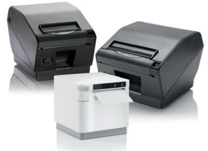
Star TSP700, TSP800 & mC-Print